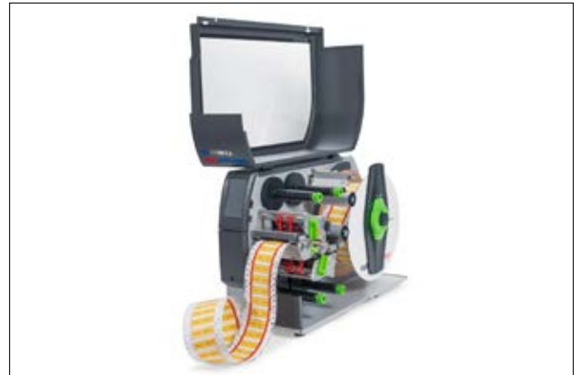
TT4030DS thermal transfer printer, ideal for shrinkable cable markers.